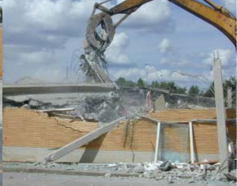
Old office being demolished