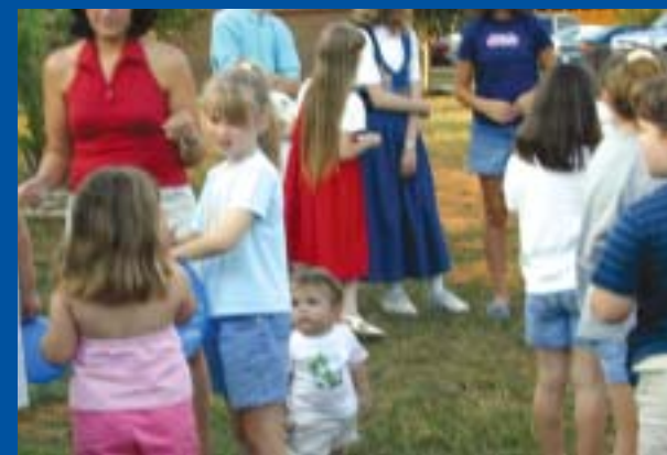
Kids are an important part of A Randolph EMC Annual Meeting.