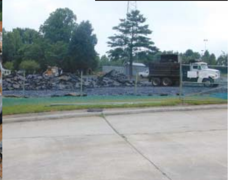
Parking area being removed