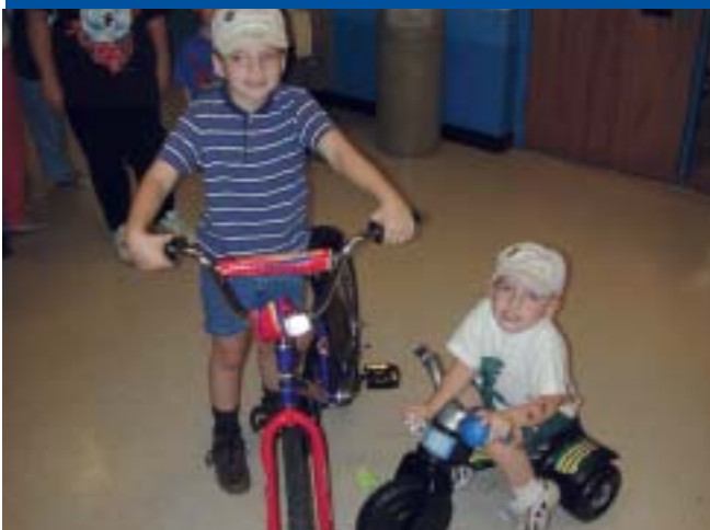
Two of the six bikes, trikes and big wheel winners ready to "ride home" after the meeting.