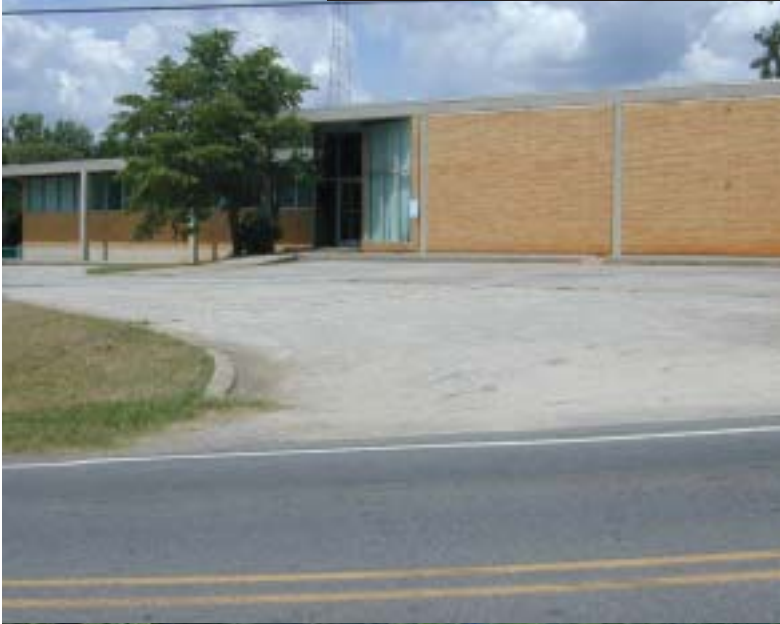
Old office prior to demolition