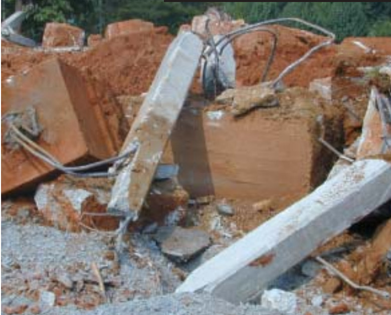
Pre-stressed concrete columns