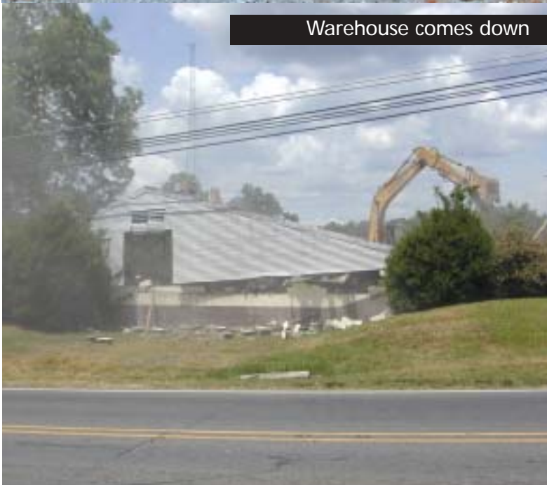
Warehouse comes down