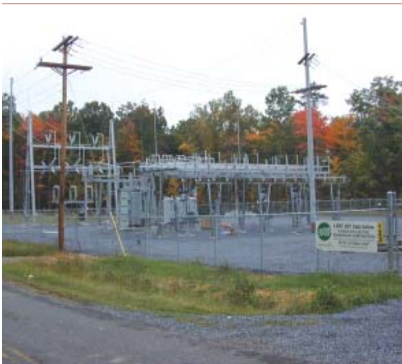
Left: The Randolph EMC Love Joy Substation has served the cooperative and its members for more than 40 years. The upgrade means the substation is ready for 40 more years of service.