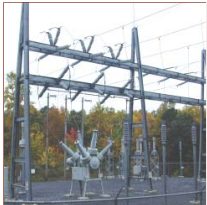
Top: This newly energized 5-mile transmission line runs from the Ether Breaker Station to the upgraded Love Joy Substation.